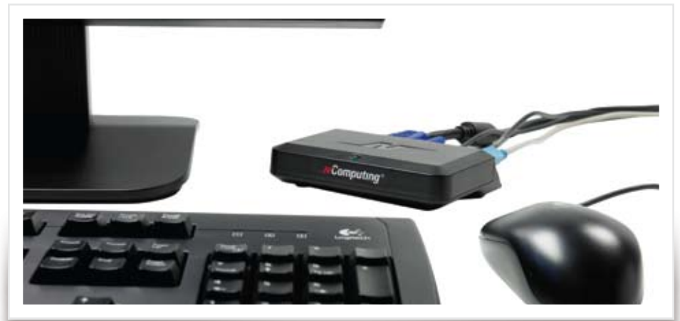
The X350 and the X550 are ideal for business, government, public access, classrooms, and computer labs.

Up to eleven users on one PC? Absolutely—today’s PCs are so powerful that the vast majority of people use only a small fraction of their available computing power. The X-series taps the unused capacity so that up to eleven users can simultaneously share a single PC. Each user gets their own virtual workspace (applications, settings, files, and preferences), but at a fraction of what it would cost with individual computers. So even though eleven people share a single system, they each get their own rich PC experience.